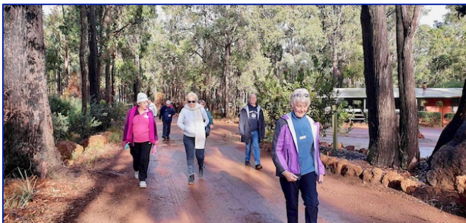
Early morning walkers in the forest