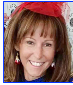
Di Young Secretary