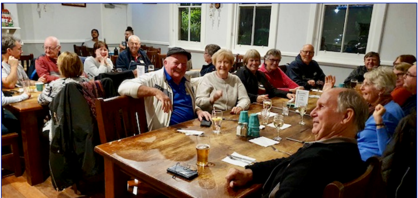
Very enjoyable dinner at the Dwellingup Hotel.