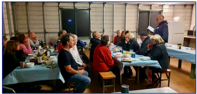
The Bush Poets are always popular.